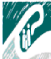
Good Shepherd Centres